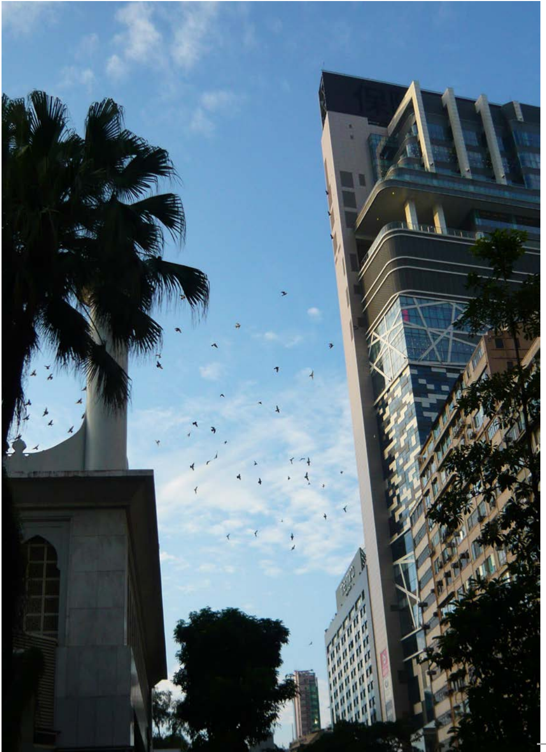
Photo: Fri 01/Jun/2012, Tsim Sha Tsui, Hong Kong

If I so miss you, Does it mean you miss me too? Summer starts, and laughs ...