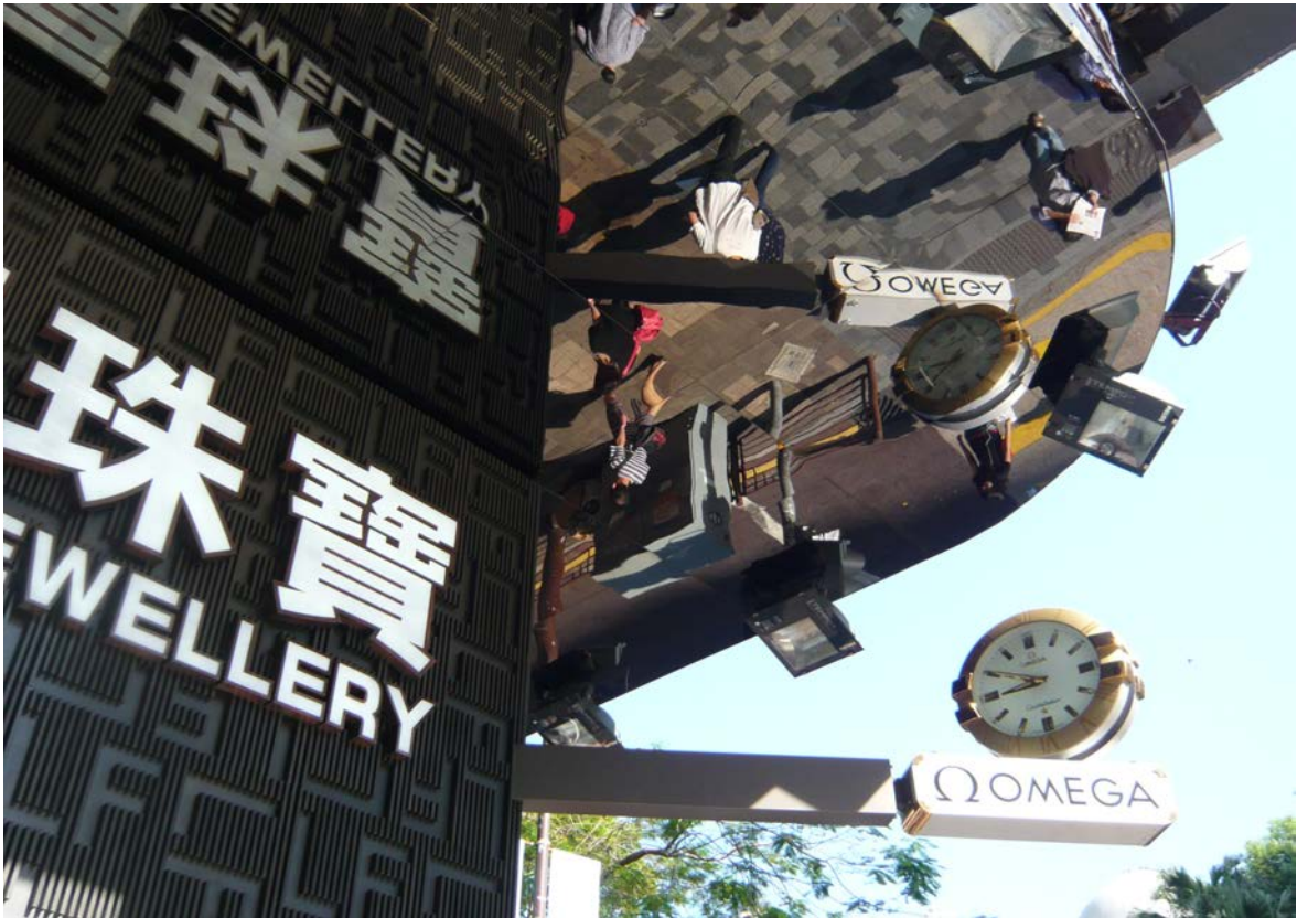
Photo: Wed 06/Jul/2011, Tsim Sha Tsui, Hong Kong