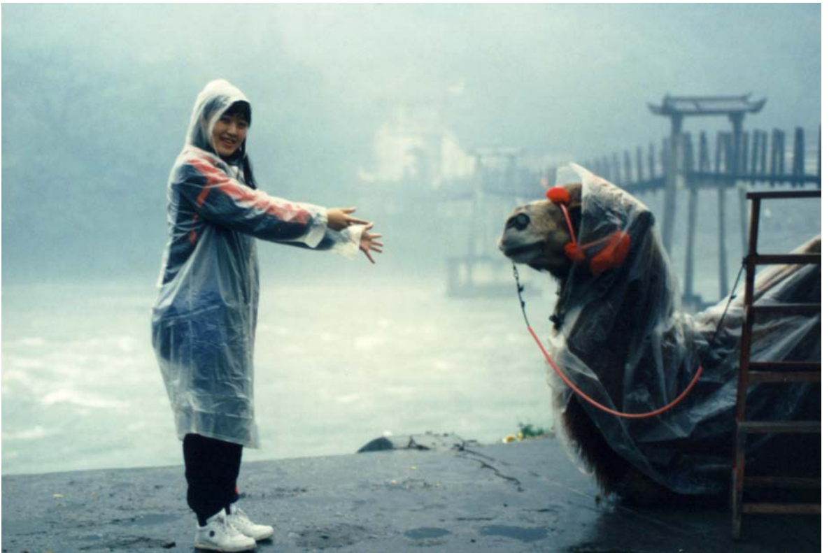
Photo: Oct 1993, Min River, Dujiangyan, ChengDu, China