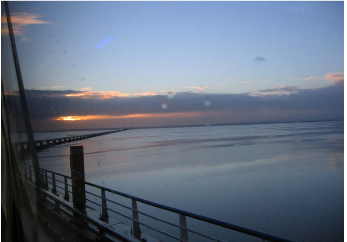
Photo: Sun 26/Dec/2004, Vasco da Gama Bridge, Lisbon, Portugal

No worry: No hate, I see you are moving on. Feel free.