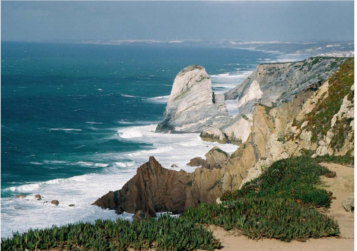
Photo: Christmas, Sat 25/Dec/2004, Cape Roca, Portugal