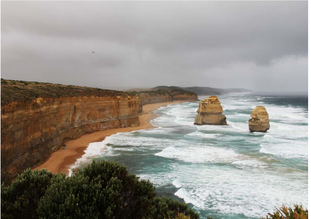
Photo: New Year's Day, Tue 01/Jan/2013, The Twelve Apostles, the Great Ocean Road, Victoria, Australia.