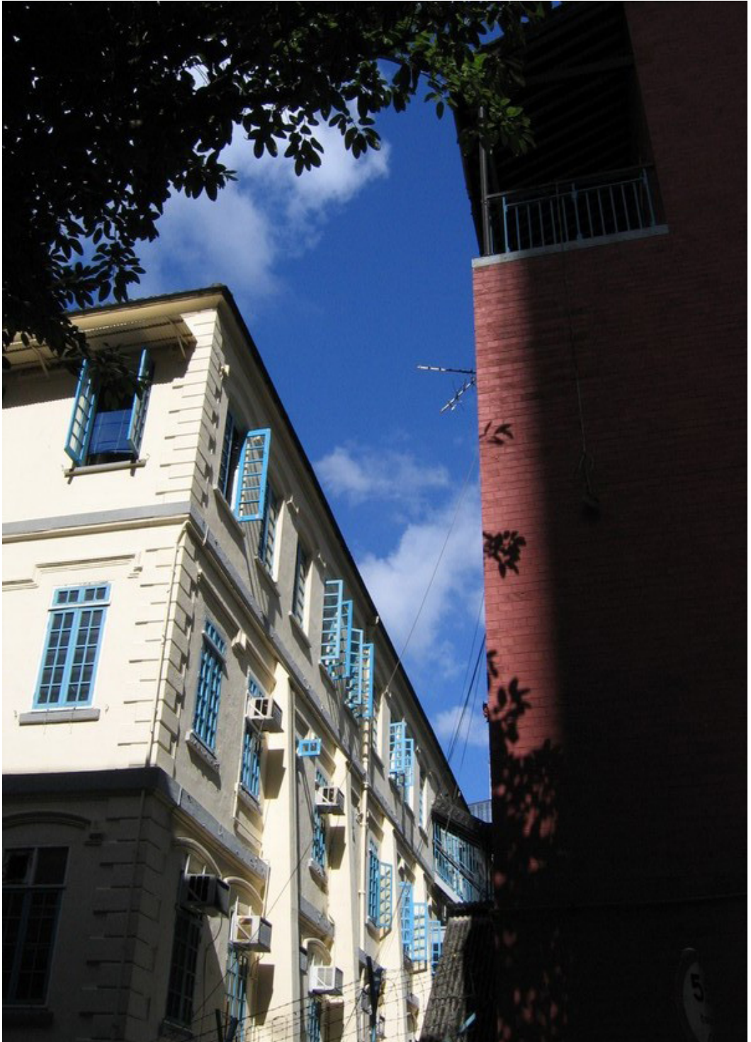
Photo: Sat 26/June/2004, Central, Hong Kong

Blue sky paints the window. The tree prints embroidery On the red house.