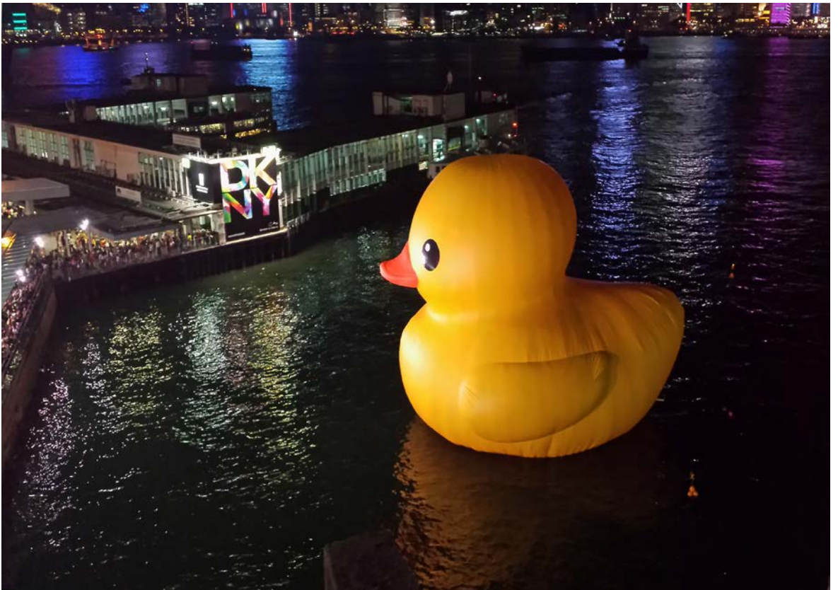
Photo: Thu 06/Jun/2013, Tsim Sha Tsui, Hong Kong

The giant rubber duck Curious about his audience – So many fans.