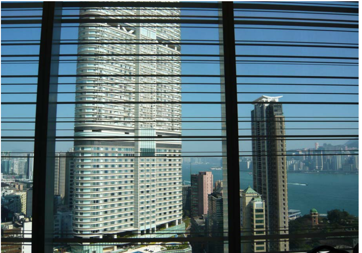
Photo: 4 th Day of Lunar New Year, Mon 07/Feb/2011, Tsim Sha Tsui, Hong Kong