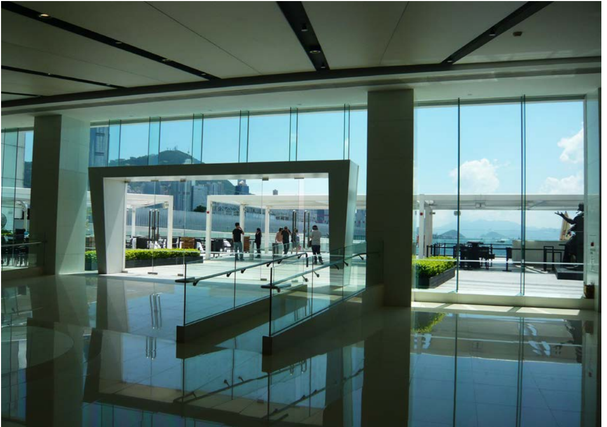
Photo: Fri 31/May/2013, Tsim Sha Tsui, Hong Kong

The hills under the Sun, The sea under the clouds – Invite you to go out.