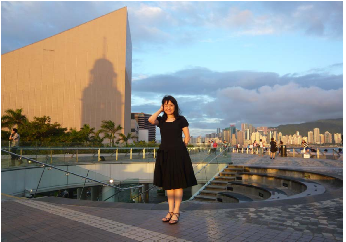
Photo: Fri 25/May/2012, Tsim Sha Tsui, Hong Kong

No, it's not my shadow – The clock-tower's projection. Playful sun and wind.