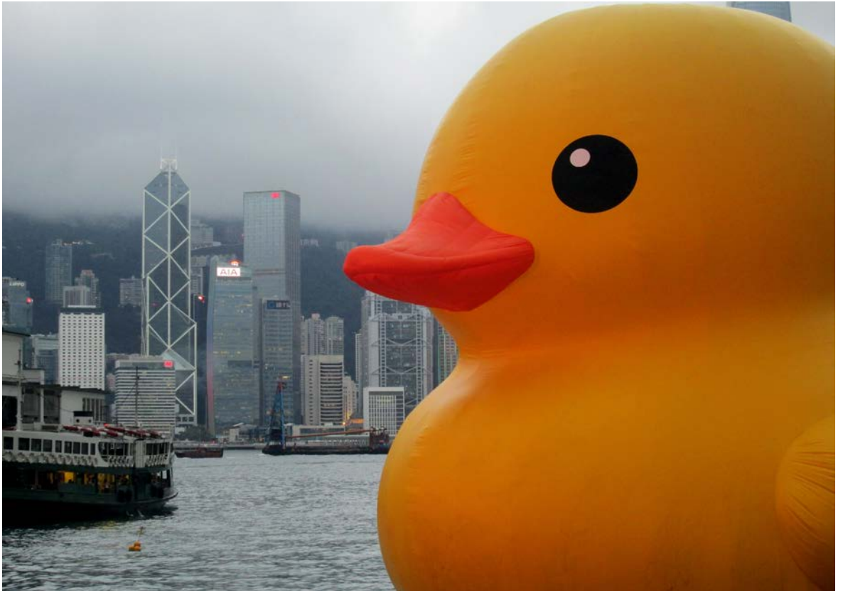
Photo: Thu 23/May/2013, Tsim Sha Tsui, Hong Kong