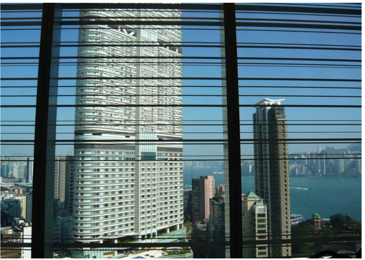
Photo: 4th Day of Lunar New Year, Mon 07/Feb/2011, Tsim Sha Tsui, Hong Kong