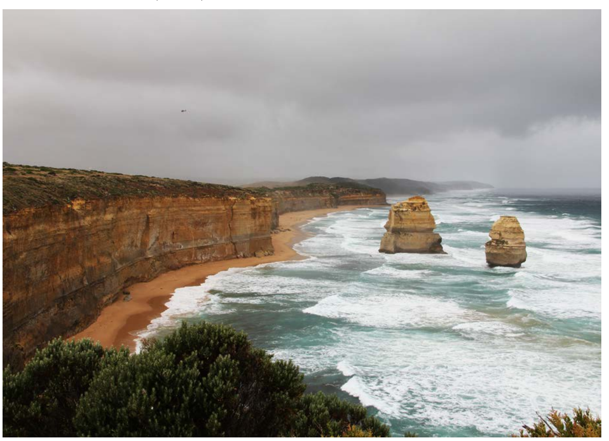
Photo: New Year's Day, Tue 01/Jan/2013, The Twelve Apostles, the Great Ocean Road, Victoria, Australia.